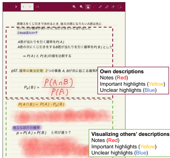
Figure 1. NoTAS note-taking and visualization interface

visualization of others' notes and highlights. The visualization colors indicate the following: The red areas indicate that other learners wrote notes. The yellow areas indicate that other learners highlighted important elements. The blue areas indicate that other learners highlighted unclear elements.